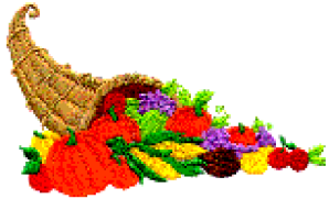
Holf2008 12043 Stitches 4.71 x 3.09 In. 8 Colors