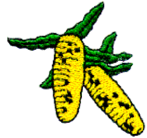
Holf2014 3497 Stitches 1.89 x 2.5 In. 4 Colors