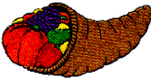
Holf2015 10139 Stitches 4.03 x 2.4 In. 9 Colors