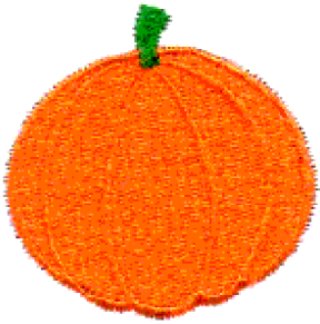
Holf2007 4665 Stitches 2.09 x 2.08 In. 2 Colors