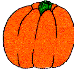
Holf2009 8620 Stitches 2.87 x 2.67 In. 3 Colors