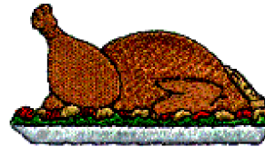
Holf2013 7401 Stitches 3.5 x 1.88 In. 8 Colors